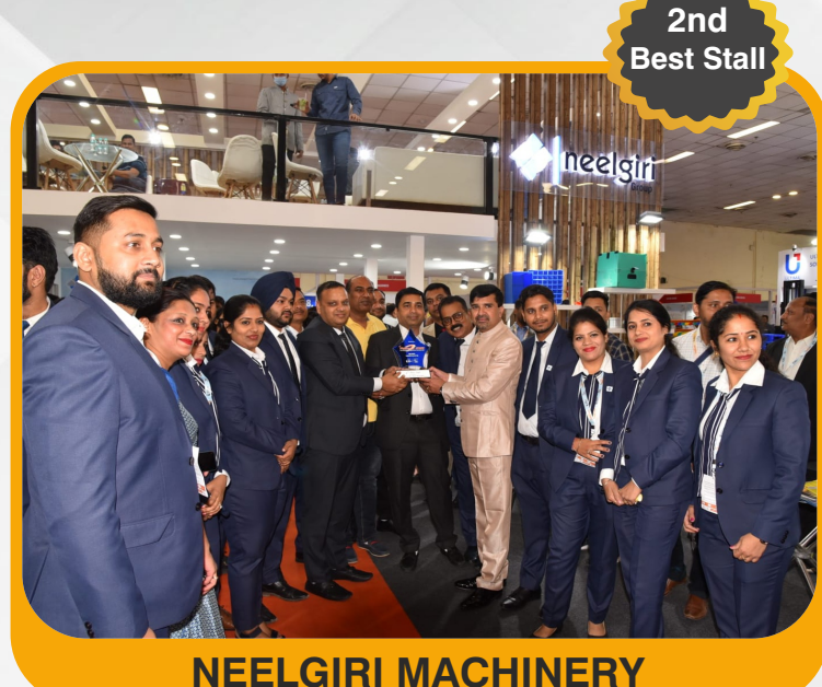
LOHIA CORP LIMITED NEELGIRI MACHINERY